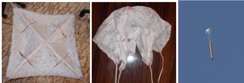
Fig: Parachute for Sonobuoy